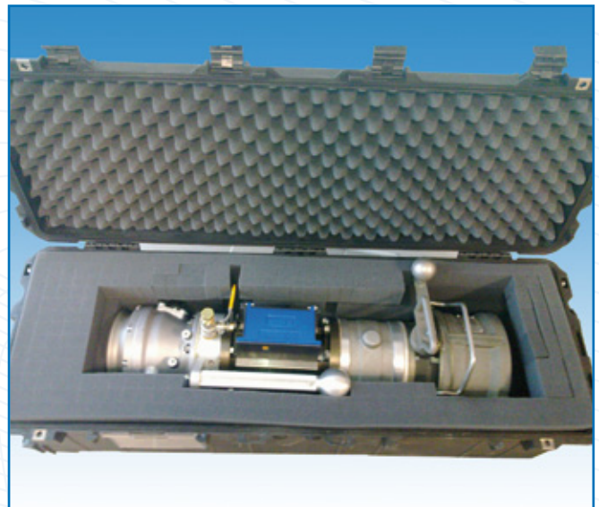
ETALCOMPT API Protective transport suitcase